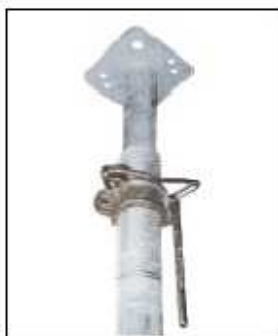
2200 Kg capacity prop