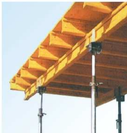
reinforced concrete floor

The beams are patented and produced with humidity resistant glue (according to rule DIN AW 100). The vertical core board of the beam is made of strong three-layer wood, with crossed fibres in order to guarantee they are non-deformable, resistant, elastic and durable.